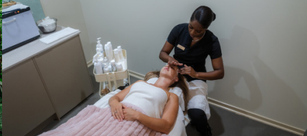
ISLAND DAY SPA