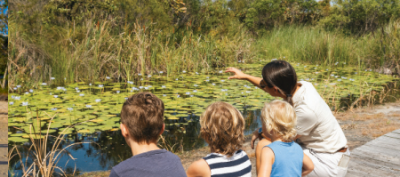
JUNIOR ECO RANGERS

NEW! Illumina Light Show: Looking for something to do after dark? Visualise the brilliance of the world's largest sand island with Illumina, the all-new light and sound spectacle at Kingfisher Bay Resort. Meet at Reception. Adult $50/Child free.