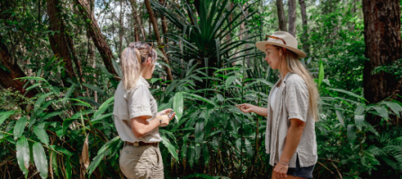
RANGER GUIDED WALKS